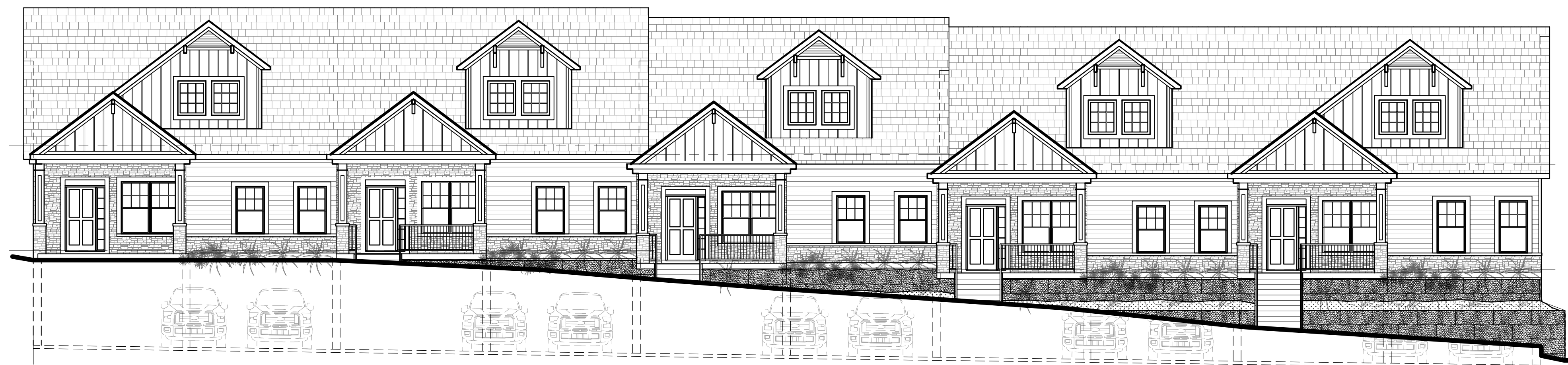
4 EAST (FRONT) ELEVATION A2.1 SCALE: 1/8" = 1'-0"