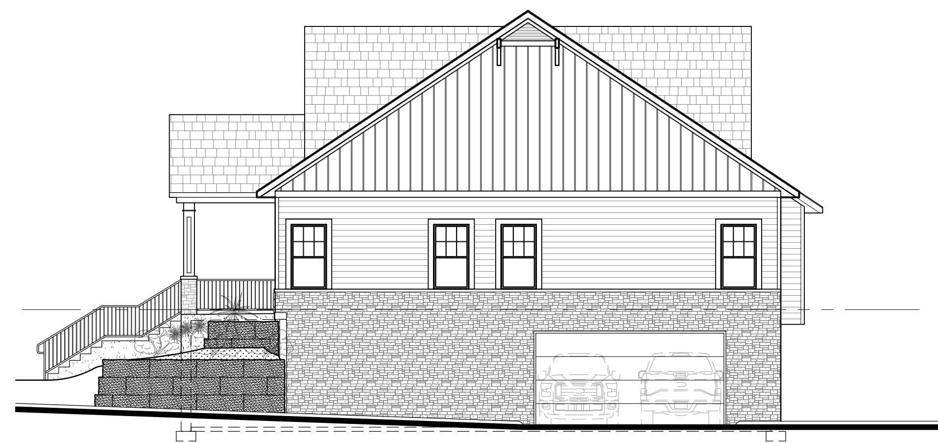
4 SOUTH (SIDE) ELEVATION A2.1 SCALE: 1/8" = 1'-0"