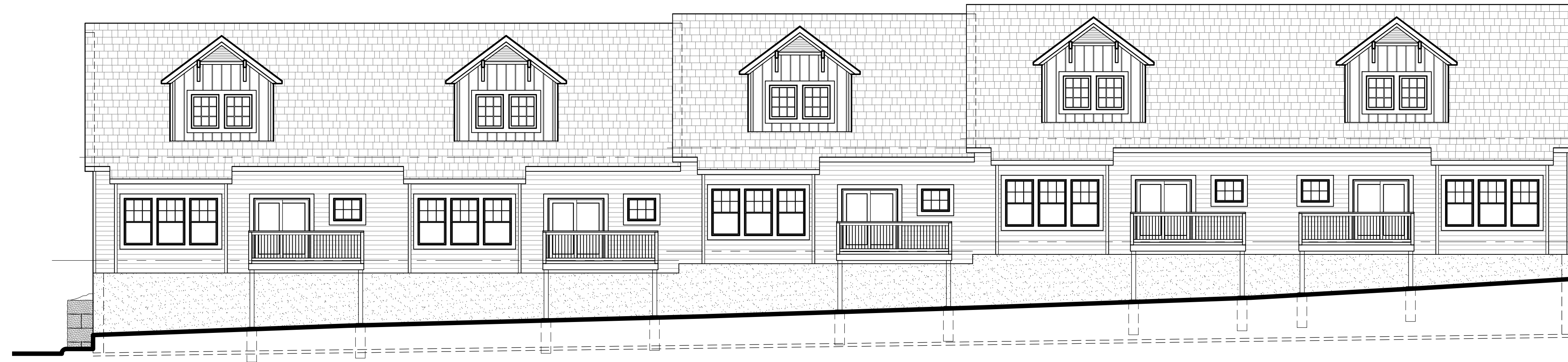
4 WEST (REAR) ELEVATION A2.1 SCALE: 1/8" = 1'-0"